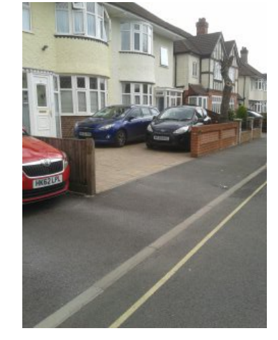
No. 18 – 2 Cars in drive