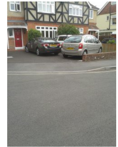
No. 16 – 3 cars in drive