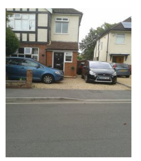
No. 12 – 4 cars in drive